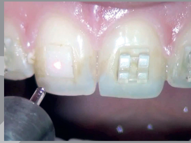
Easy bracket removal