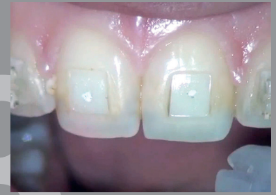
Intact enamel surface