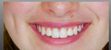
After complete treatment