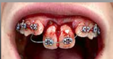
Before treatment / day 0