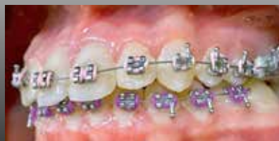
During PBM therapy / Day 8