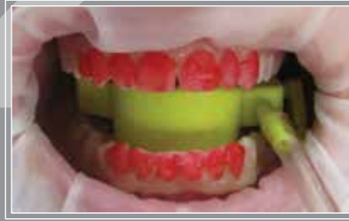
Bleaching gel is applied to the teeth.