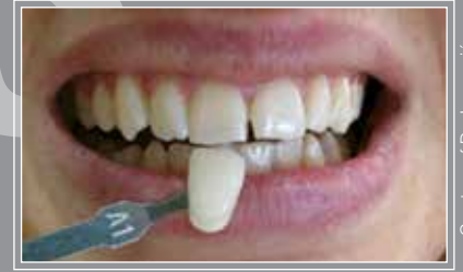
Immediately after (A1 VITA Shade Guide)