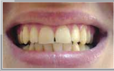
Before (A3 VITA Shade Guide)