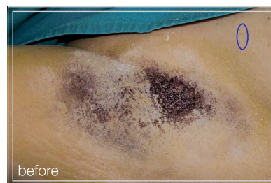
Iodine-starch test before laser treatment

The power used in Laser Hyperhidrosis Treatment is up to 20 W. In order to ensure maximum selectivity during treatment, the SP Dynamis features a special QCW mode in which localized spikes reach power levels in the kW range. This enhances the selective effect of the laser when targeting the tissue and ensures speed, efficiency and safety in surgical procedures. Treatments are therefore less invasive and the treated area heals faster. The user-interface is designed from a surgeon's perspective, offering a full view of all treatment parameters on one screen. At the touch of a button, the SP Dynamis accommodates laser parameters to the application, providing unrivalled convenience.