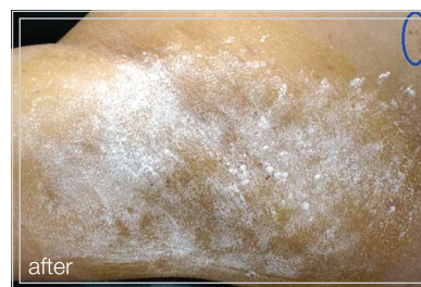
Iodine-starch test after 12 months