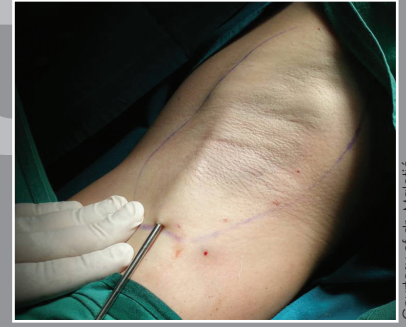
Step 3: REMOVE the destroyed glands