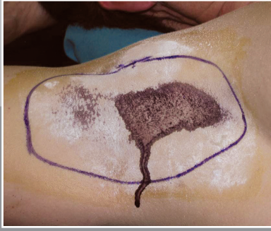
Step 1: LOCATE - iodine starch test