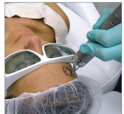
Fig.3: Fotona's FS01 handpiece - the latest breakthrough in fractional laser technology.

The new FS-01 handpiece is compatible with all Fotona aesthetic Er:YAG laser systems. No additional investment in adapters or cables is necessary.