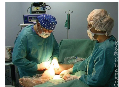
Fig. 3: Fotona's EVLA Tx have exceptional success rates and shorter recovery times

all treatment parameters on one screen. At the touch of a button, the laser system accommodates laser parameters to the application, providing unrivalled convenience.