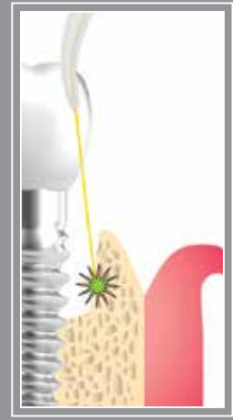
Bacterial reduction and biostimulation of the bone tissue with Nd:YAG