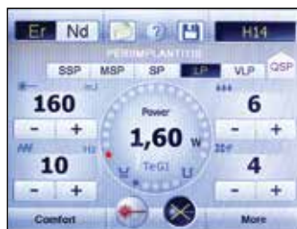
Fig. 1: LightWalker peri-implantitis screen

Removal of granulation tissue from the alveolar bone and connective tissue with Er:YAG laser is selective. The bactericidal effect of Er:YAG on the surgical site is highly effective and the implant surface is completely cleaned without chemicals. The subsequent Nd:YAG treatment step promotes faster healing by decontaminating and biostimulating the tissue. Inflammation, swelling, and bleeding of soft-tissue lesions, which may lead to bone loss, can be handled without surgery, and healthy peri-implant tissue assure greater long-term implant success.