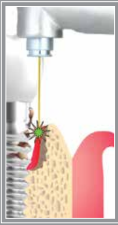
Removal of the soft-granulation tissue and ablation of the infected bone with Er:YAG